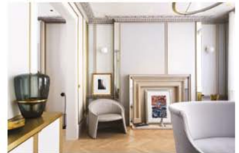
Late Actress Carrie Fisher's Abode is Now Home to a Loving English Family