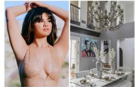
Inside Selena Gomez's Breathtaking Calabasas Estate